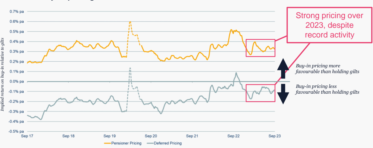
Chart 2: Buy-in pricing remains attractive over 2023

The model is calibrated against live quotation and final transaction pricing. Buy-in pricing depends on a wide range of factors such as transaction size, benefit structure, membership profile and insurer appetite and can differ materially from that shown.